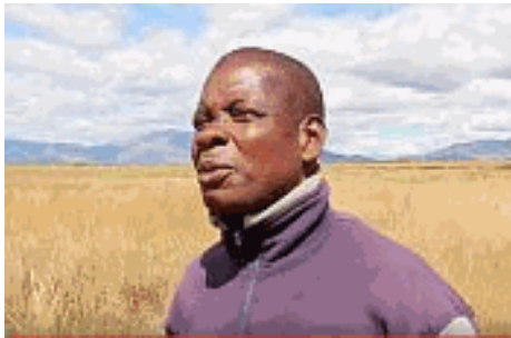
Mega agrobusiness grows resentment in Mozambique