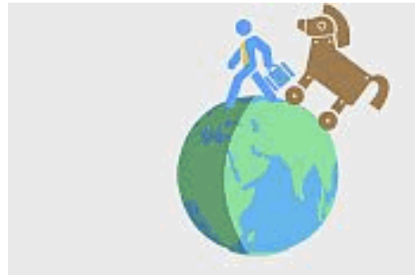
Trade and Health