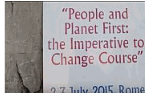
Towards system change: conference People and Planet First, the Imperative to change course