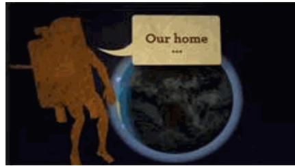
Enoughness – Restoring Balance to the Economy