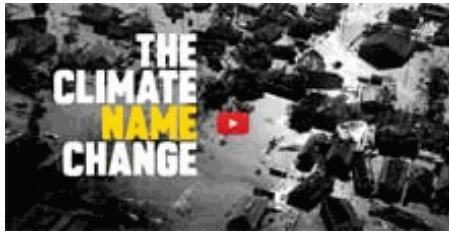
Climate Name Change