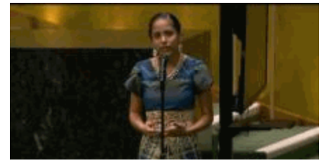
United Nations Climate Summit Opening Ceremony – A poem to my Daughter