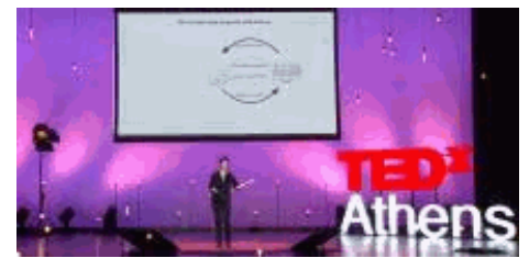
Why it's time for Doughnut Economics Kate Raworth TEDxAthens