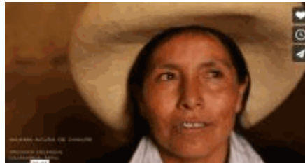
How One Indigenous Woman Took On a Multinational Mining Corporation... And Won