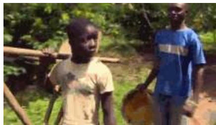
Chocolate Child Slaves