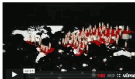
The Trans-Pacific Partnership: A Threat to Affordable Medicines for Millions - Doctors Without Borders