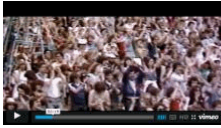
Disruption is an unflinching look at the devastating consequences of our inaction in the face of climate change - and gives a behind-the-scenes look at a part of the effort to organize the People's Climate March.