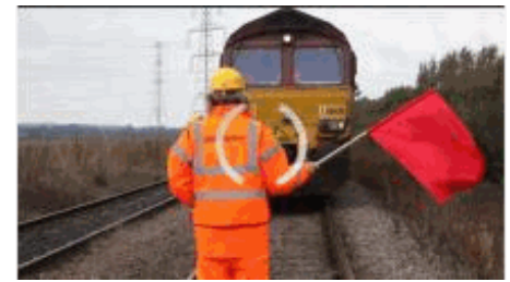
People Taking a Stand Against Coal