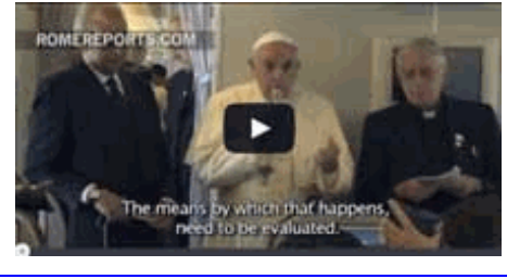
The Church and War: A Look at Humanitarian Intervention