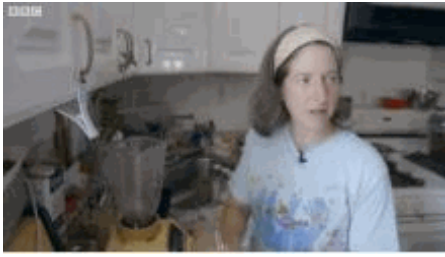
Dumpster divers seek out free food as prices increase