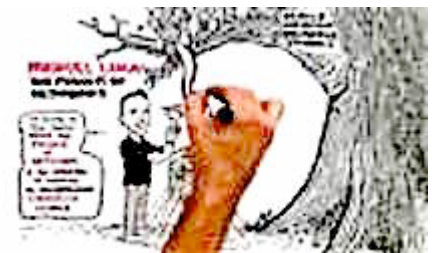
Power of Networks