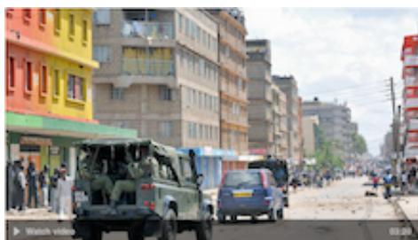
Kenya: Eastleighwood liven up an unpopular district