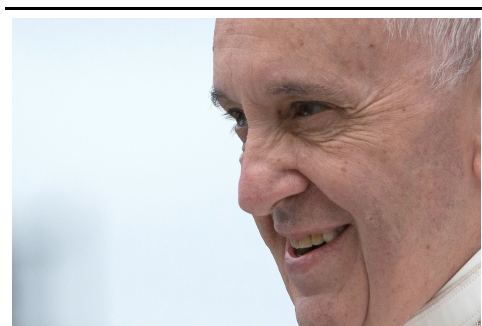
Pope Francis visit to US Congress

Action on behalf of justice is a constitutive dimension of the preaching of the gospel.