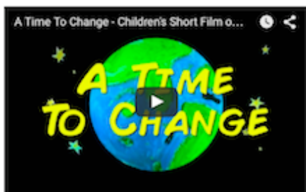
Time to Change