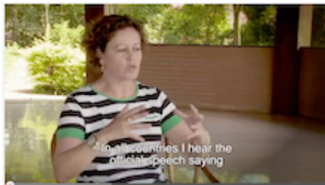
Churches and Mining in Latin America