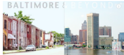
Life in Baltimore, from the people who call it home